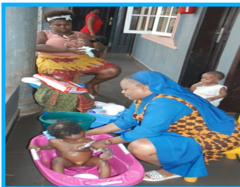
Our sisters taking care of orphans abandoned children in Nigeria.