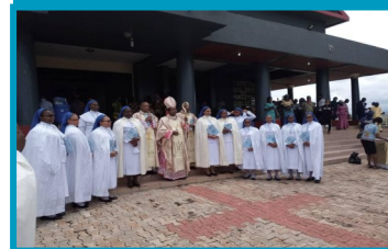
BRAVO DEAR SISTERS

The love of God compels us (2 Cor: 5-14)