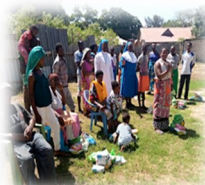
Distribution of food to the slum dwellers in Mombasa Kenya and to the less privileged in Nigeria.