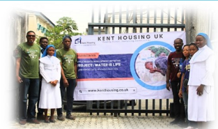
Kent housing /Ripple Height kick off Water project in Nigeria