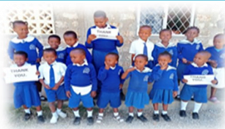
Children of Madonna Nursery

Kenya food program: Christmas is a time of joy and sharing, a time to reach out so that even those who cannot afford it can enjoy the true Christmas spirit. The slum dwellers of Mombasa, Kenya, were not left out in our food donation this year, receiving food items and drinks.